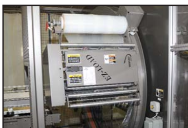
EZ-LOAD FLM-SAVR® Film Carriage with "Swift Change" Film Mandrel