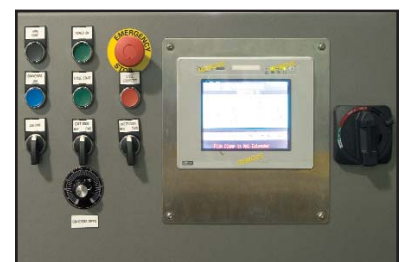
User-Friendly Operator Controls