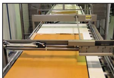
Optional Adjusting Guides