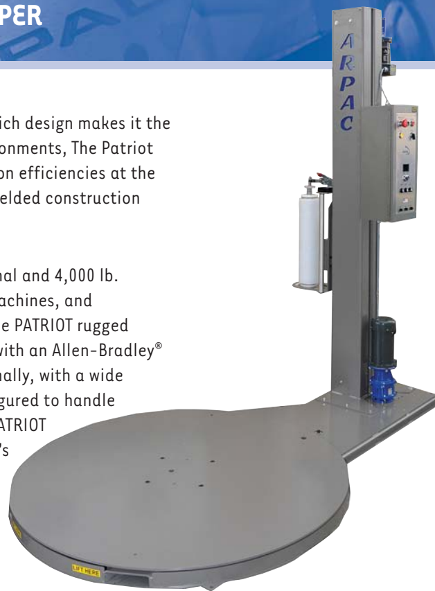
low profile 4,000 lb. load capacity

If you are ready to automate your pallet wrapping process, call your local ARPAC distributor, and let the PATRIOT stand by you.