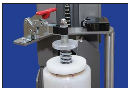
Standard "Swift Change" Film Mandrel