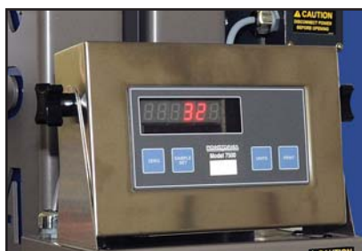
Optional WRAP-N-WEIGH® Operator Display