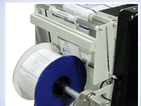
Quick & easy loading of the roll