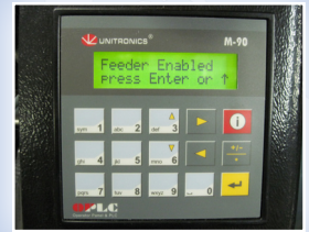
Standard control panel

12900 Plaza Dr, Cleveland, OH 44130 | Ph: 216-267-1911 | sales@clamcopackaging.com www.clamcopackaging.com