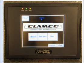
PLC with large color-touch screen

12900 Plaza Dr, Cleveland, OH 44130 | Ph: 216-267-1911 | sales@clamcopackaging.com www.clamcopackaging.com