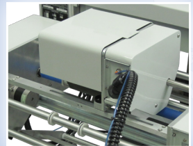
In-line thermal transfer printer